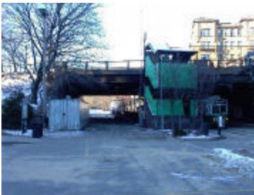
View of existing right-of-way at MBTA Fenway station

This photo (left) shows the right-of-way available for conversion under Park Drive between the Riverway and Landmark Center. This would provide a pedestrian/bicycle route which eliminates conflict with the Sears Rotary Gateway.