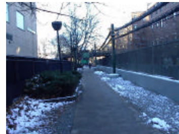
Existing pedestrian path between Fenway and Yawkey Way stations

This photo (left) shows the right-of-way available for conversion under Park Drive between the Riverway and Landmark Center. This would provide a pedestrian/bicycle route which eliminates conflict with the Sears Rotary Gateway.