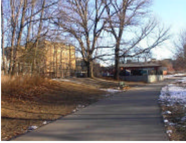
Riverway Park looking east – Back Bay Yard maintenance facility

Background: With the rapid expansion of the Kenmore Square/Longwood Medical and Academic Area (LMA), there are a number of challenges, and opportunities, to improve transportation for pedestrians and bicyclists.