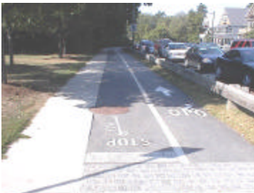
Combined pedestrian/bicycle path at Fresh Pond Parkway, Cambridge

An example of a combined pedestrian/bicycle path is shown at the left. By connecting the path at Riverway Park to a new path under Park Drive, and using existing open land between Fullerton Street and Lansdowne Street, Riverway Park and Kenmore Square can be directly linked.